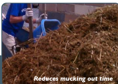
Reduces mucking out time