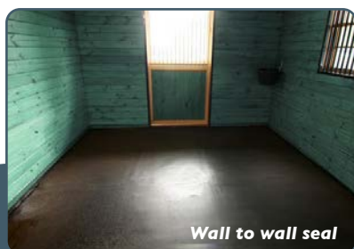
Wall to wall seal

Reduces bedding costs Provides multiple health benefits Helps protect your horse