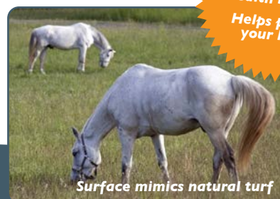
Surface mimics natural turf